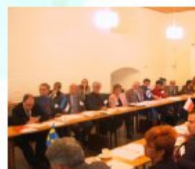
The first Via Baltica Nordica Forum was organised on 11-12th October 2002 in Häme in Hämeenlinna, Finland.